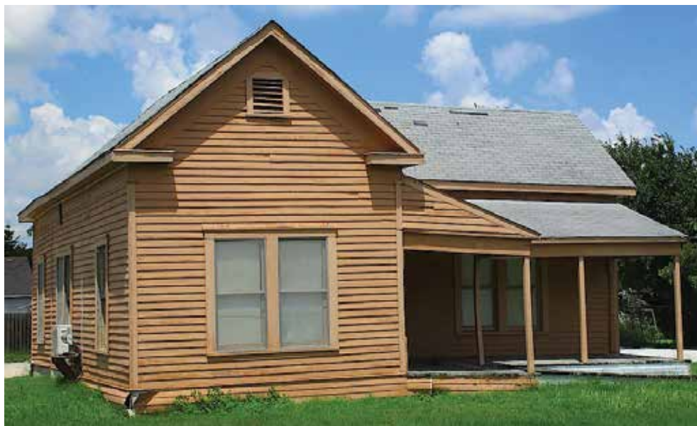
The Central Baptist Church Youth Center at 407 Eggleston St in Manor was dedicated on August 30th.

(See more Ribbon Cutting photos on page 4)