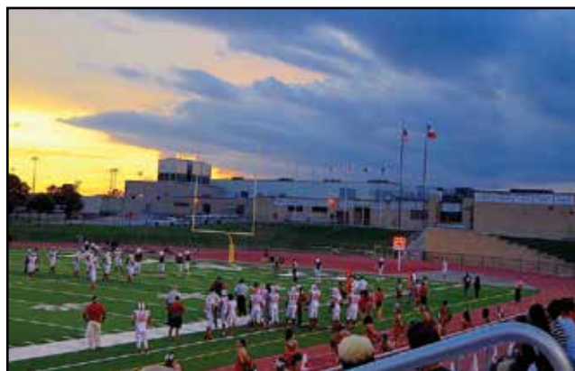
A spectacular Texas sunset in Leander.

Manor will battle Bastrop at home on Friday September 2nd at 7:30 p.m. They will also celebrate Senior Night, recognizing the Mustang seniors of 2016-2017. Let's all come out for a great night of football and support our team!