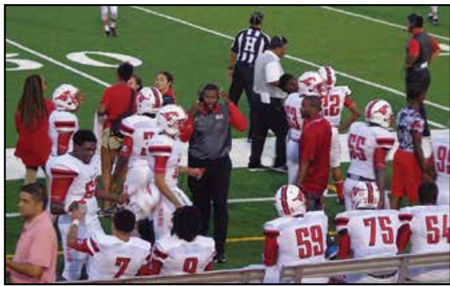
Manor coaches couldn't find the right tactics or strategy against Rouse Friday

The Manor Mustangs met Leander Rouse at 7:30 pm on Friday, August 26th at the A. C. Bible Jr. Sta-