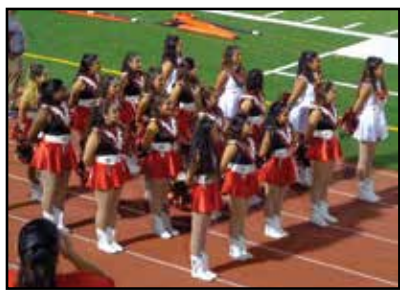
The Drill Team prepares to take the field at halftime.

Rouse came out energized and hungry to score. They quickly racked up 21 points in the third quarter. Manor quarterback Slagel scored on a run with a good extra point. Manor struggled to defend their goal